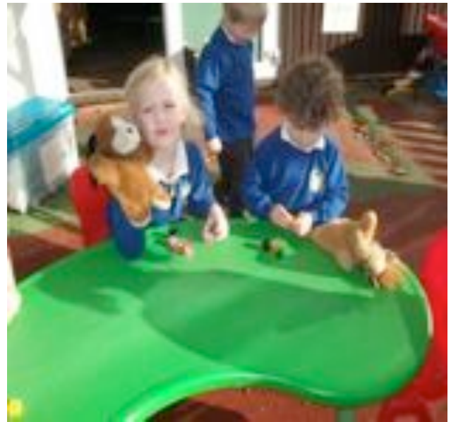
Sharing the cubes between the puppets

This term the children have also been finding out about healthy eating.